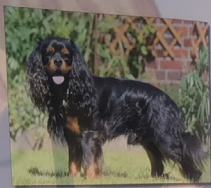
Black and Tan